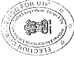
(Ms. Bhupinder Prasad) Election Commissioner